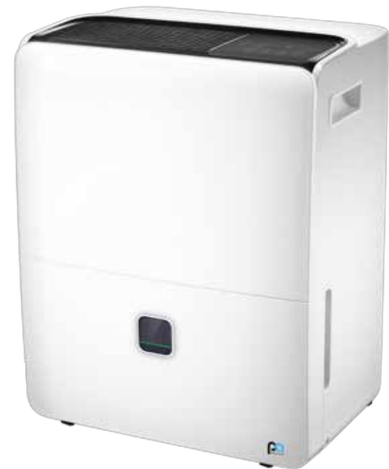
Direct to Drain