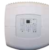
Control Panel on Unit