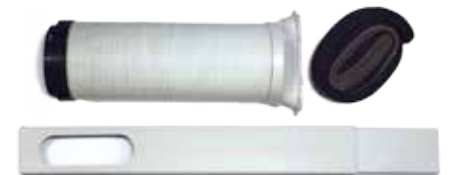
Slider Kit & Vent Hose (included)