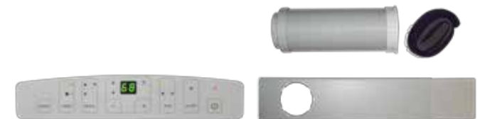
Control Panel on Unit