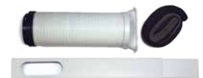
Slider Kit & Vent Hose (included)