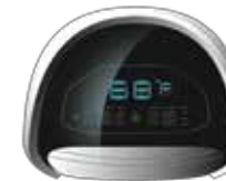
Control Panel on Unit