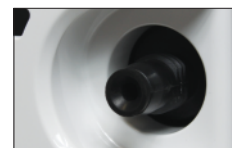
Direct to Drain