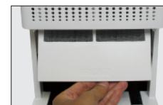
Easy Access Washable Filter