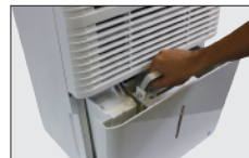
Easy Access Bucket with Carrying Handle