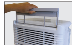
Easy Access Washable Filter