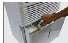
Easy Access Bucket with Carrying Handle