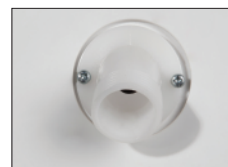
Direct to Drain